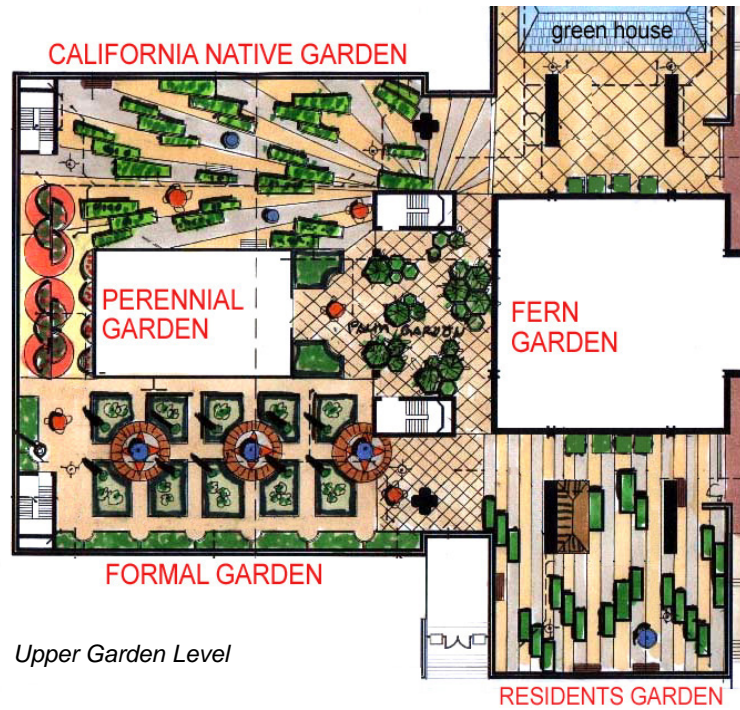
Upper Garden Level

Water leakage necessitated new roof-deck gardens for this elderly retirement facility. Staff and residents expressed concern over the demolition of the existing planters and plant material necessary for reconstruction of the waterproofing. This scheme creates several themed gardens utilizing patterned paving, specific plant material and various shaped pre-cast planters. The stand-alone planters have a self-contained irrigation system which eliminates structural slab penetrations. The result will be a diversity of outdoor spaces which will be easy to maintain.